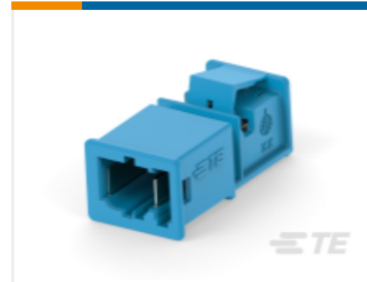
TE Part # 2302461-3 MATENET INLINE COUPLER, ASSY, COD C