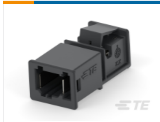
TE Part # 2302461-1 MATENET INLINE COUPLER, ASSY, COD A