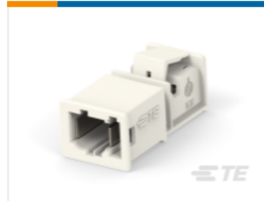
TE Part # 2302461-2 MATENET INLINE COUPLER, ASSY, COD B