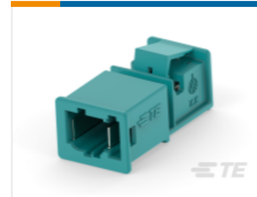
TE Part # 2302461-9 MATENET INLINE COUPLER, ASSY, COD Z